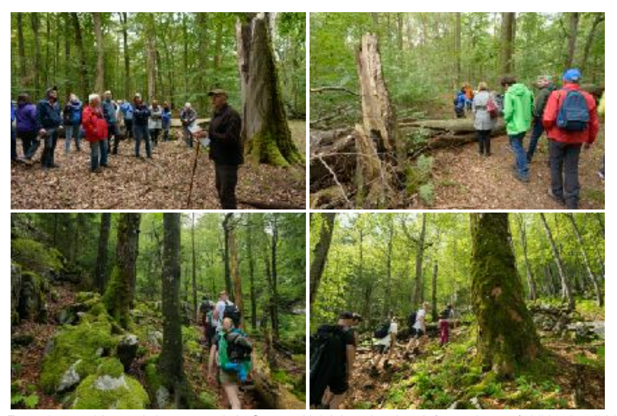
Excursion to old growth forest stands in German Hainich national park (upper images), hiking in wild forests in Croatia (with students HFR; bottom).

In marketing, tourism regions that establish a "direct link to national parks or biosphere reserves are often more successful". Original nature thus becomes a "unique selling point" in marketing.