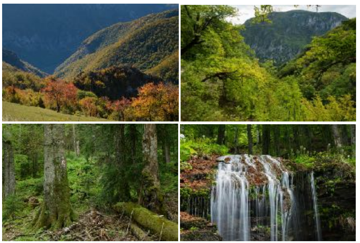
Variety of views and landscape types counts.