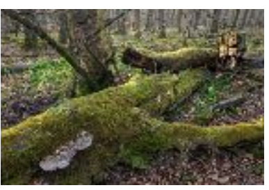
Guided tour into wild forests in Germany's Hainich national park.