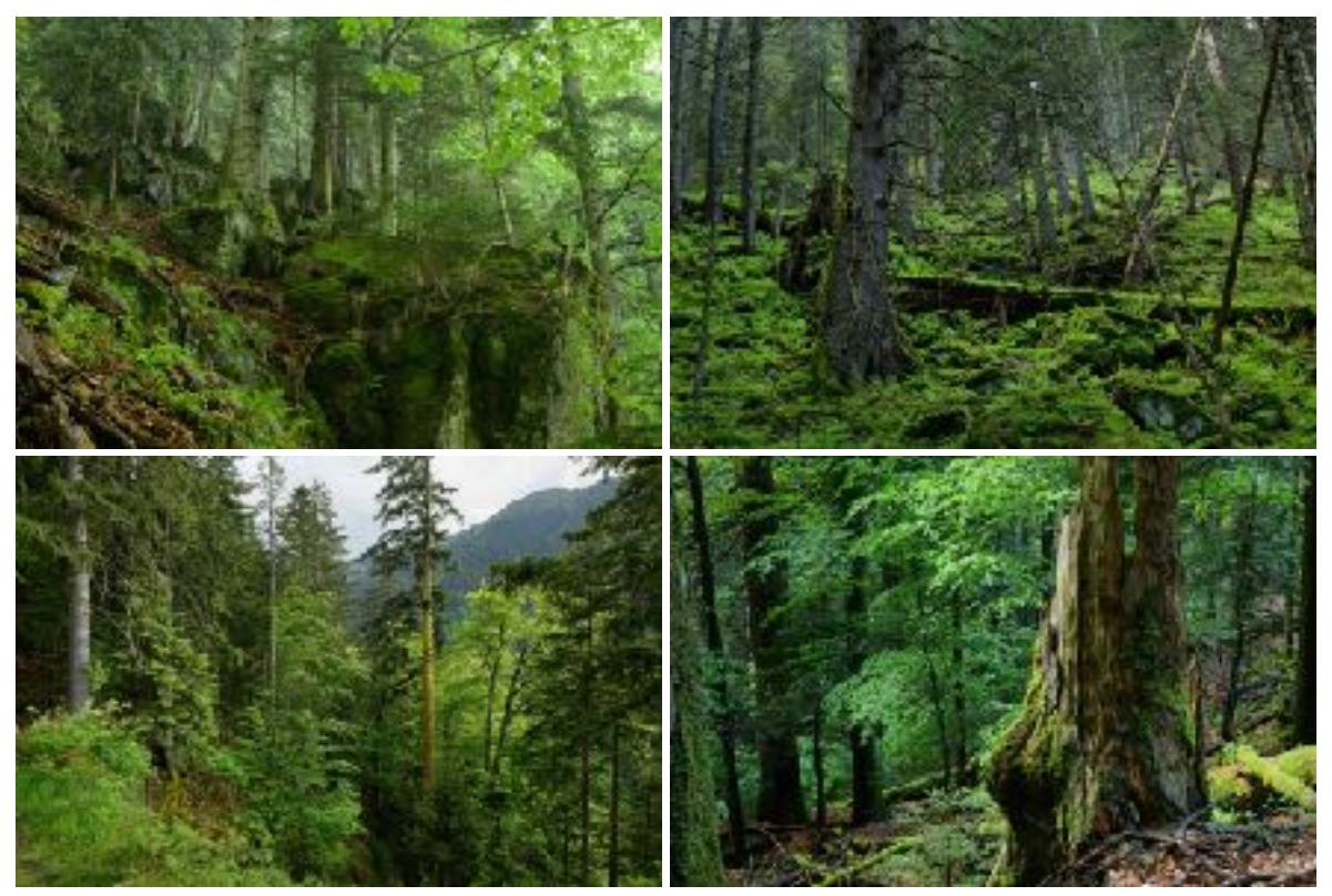
Native tree species, no clearly visible indications of human activities, ecological processes are not significantly disturbed; dominated by natural structures and dynamics. Frequent features: uneven aged, diverse tree stands incl. old / large trees, lying and standing dead wood.