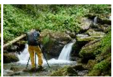
Test hike in Romania's Fagaras Mountains with members of the Austrian Nature Photographers' Association VTNÖ in August 2024.