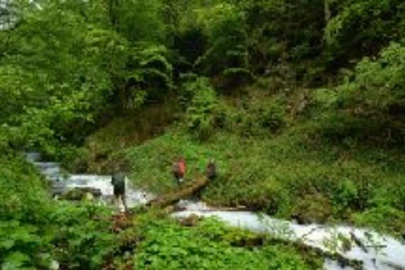
Hiking in wild forests in Romania's Fagaras Mountains.