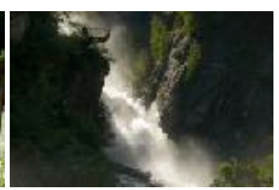
Iseltrail in East Tyrol in Austria: 5-days hike along an undammed glacier river on a marked trail with branding, rest areas, viewing platforms and a nature information system.