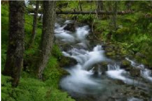
Ecosystem functions of primary/old growth forests: Water storage/ purification, carbon uptake and sequestration, ground shading and soil stabilisation, flood prevention, oxygen production, local cloud formation and landscape cooling.